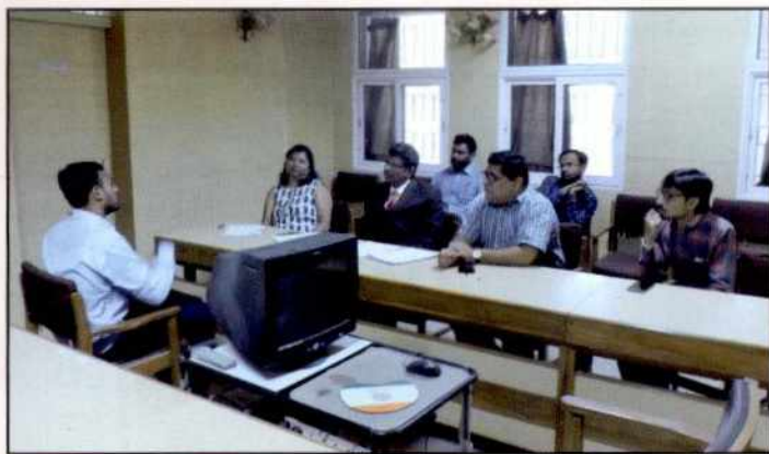
Student Counseling in Placement