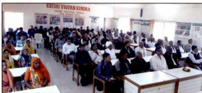
Training on "Processing and Cultivation Practices of Spices Crops"