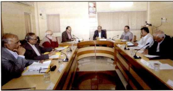
Academic Council Meeting of JAU, Junagadh held on December 15, 2017