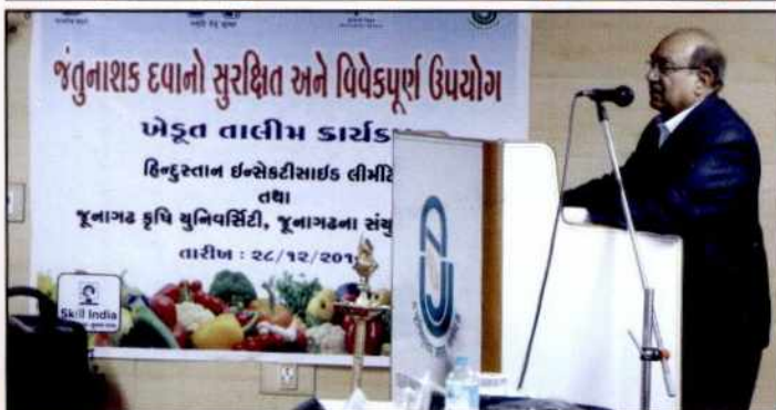
Training programme on "Safe & Judicious Use of Pesticides and IPM"