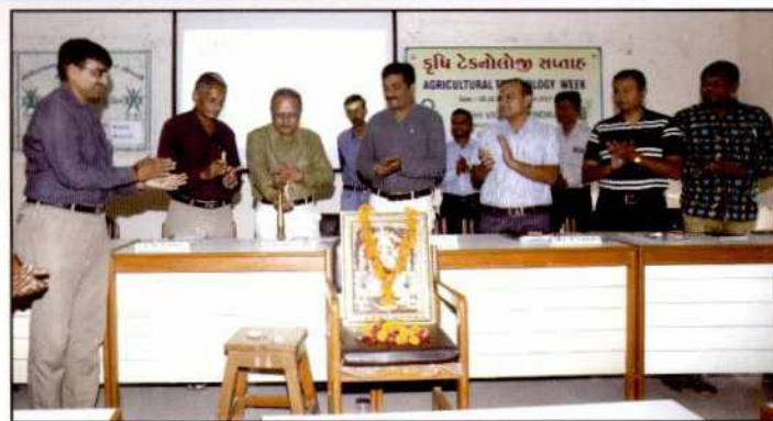
Inauguration of Agricultural Technology Week at KVK, Junnagar (October 3, 2017)