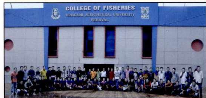
NSS Volunteers of College of Fisheries, Veraval, celebrated world Lion's day on October 8, 2017 in association with Department of Forest