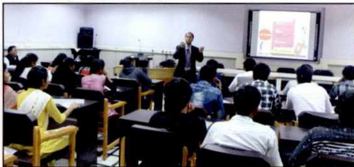
Campus to Corporate Training Programme