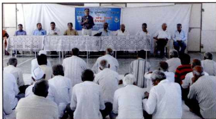
Celebration of "National Seed Day"