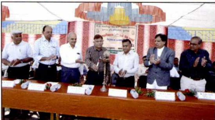
Inauguration of Inter-Collegiate Kabaddi and Kho-Kho tournaments