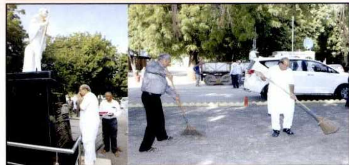
Celebration of 148 th Birth Anniversary of Father of the Nation Mahatma Gandhi at JAU, Junagadh on October 2, 2017 by offering floral tribute on the Statue of Mahatma Gandhi and taking part in Swachhha Bharat Mission