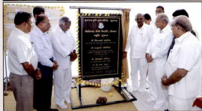
Bhumipujan of "College of Agriculture & Boy's Hostel"