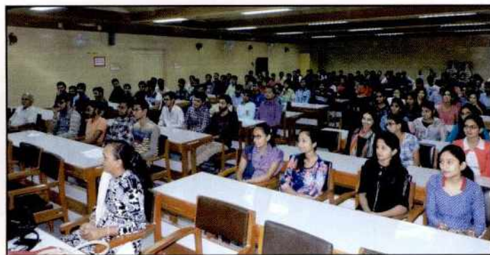
Celebration of Agricultural Education Day