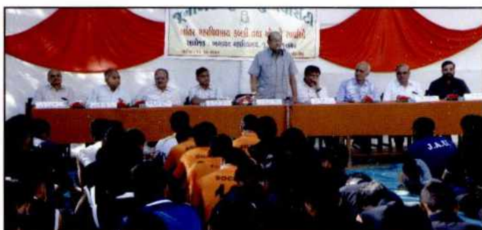
Inauguration of Inter-Collegiate Kabaddi and Kho-Kho tournaments